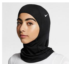
Nike Pro Hijab

Neck coverings approved in all categories, Nike and Adidas only