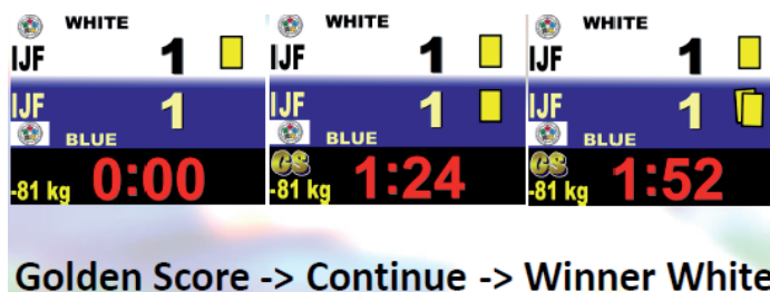
Golden Score -> Continue -> Winner White